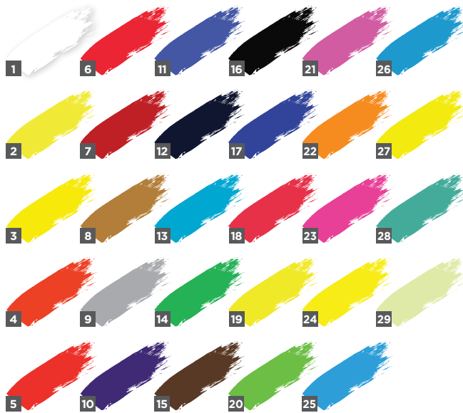
COLORS SHOWN ARE APPROXIMATE

Professional quality acrylic screen printing inks available across a range of 30 brilliant colors, including 6 bold fluorescents, 4 glow in the dark colors and 2 black inks. With unrivaled open time, Speedball® Acrylic Screen Printing Inks provide artists with the ultimate flexibility to create without worry. Colors print with richness and are ideal for use on paper, wood and cardboard. Non-flammable and contains no solvents.