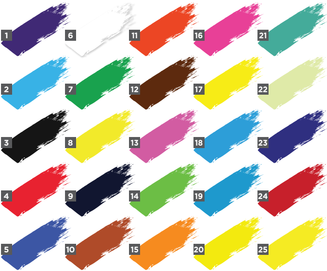
COLORS SHOWN ARE APPROXIMATE