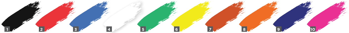
COLORS SHOWN ARE APPROXIMATE