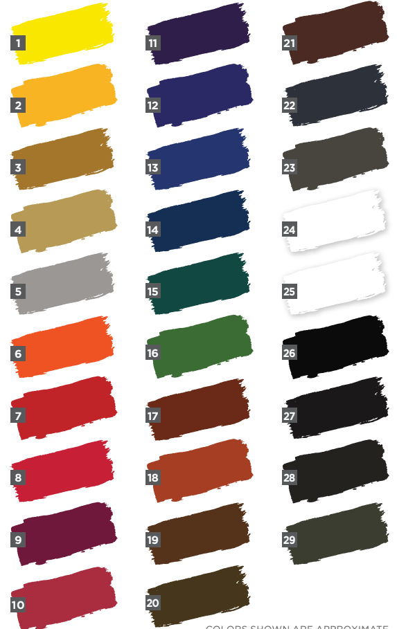
COLORS SHOWN ARE APPROXIMATE