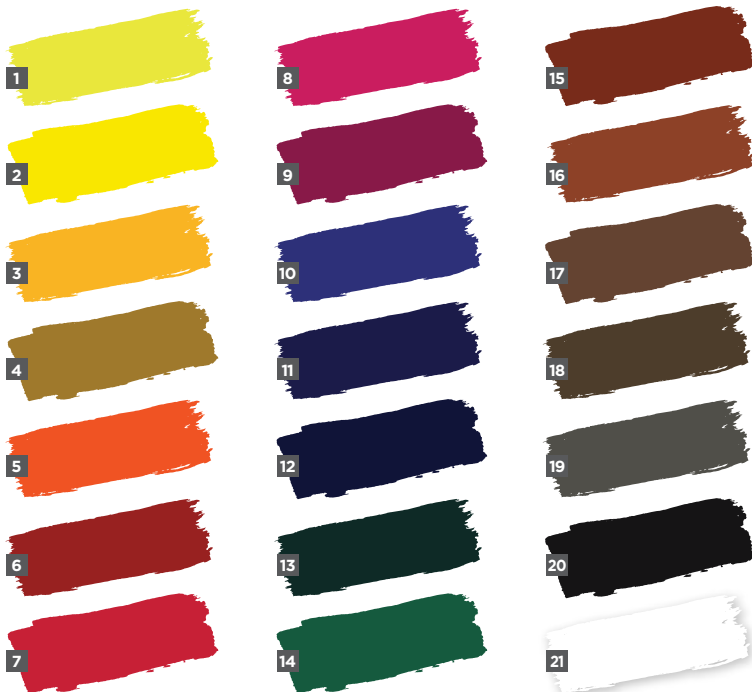
COLORS SHOWN ARE APPROXIMATE

Its rich working consistency is excellent for all monotype techniques. It stays wet on the plate for an extended period of time, allowing many hours to create an image. It will print well on dry or damp paper, and it cleans up easily with water.